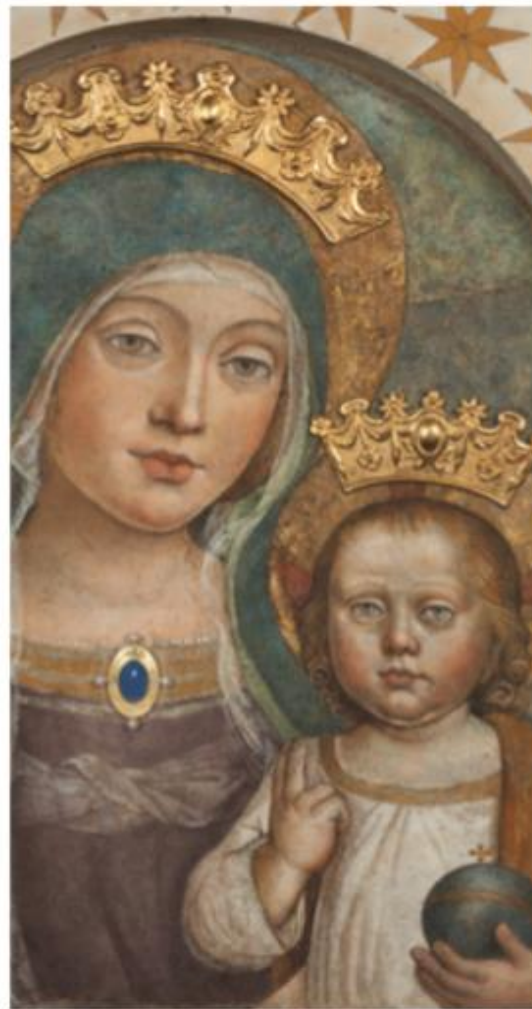
The ancient fresco of Madonna del Soccorso (Our Lady of Help) in St. Peter's Basilica was restored with the support of the Knights of Columbus to mark the Year of Faith (2012-2013).

O Mary, you always brighten our path as a sign of salvation and of hope. We entrust ourselves to you, Health of the Sick, who, at the Cross, took part in Jesus' pain while remaining steadfast in faith.