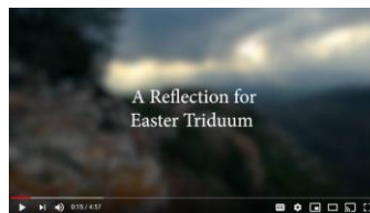
Reflection for the Easter Triduum

My Jesus, I believe that you are present in the Most Holy Sacrament. I love you above all things and I desire to receive you in my soul. Since I cannot at this moment receive you sacramentally, come at least spiritually into my heart. I embrace you as if you were already there and unite myself wholly to you. Never permit me to be separated from you. Amen.