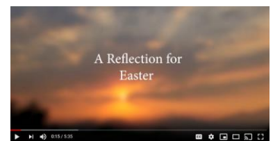
Reflection for Easter