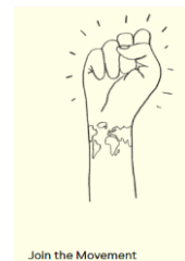
Join the Movement