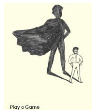
Play a Game