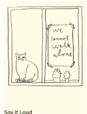
Say it Loud