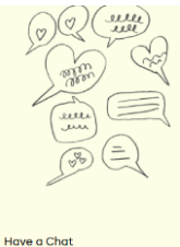
Have a Chat