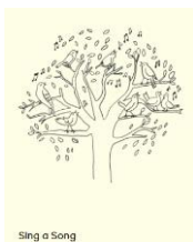
Sing a Song